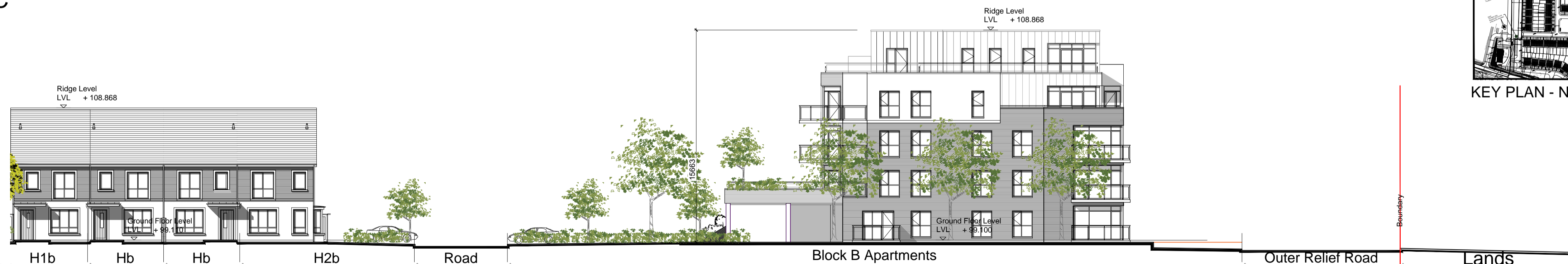
CONTEXT SECTION 3 - 3, PART 'D' Scale 1:200@A1