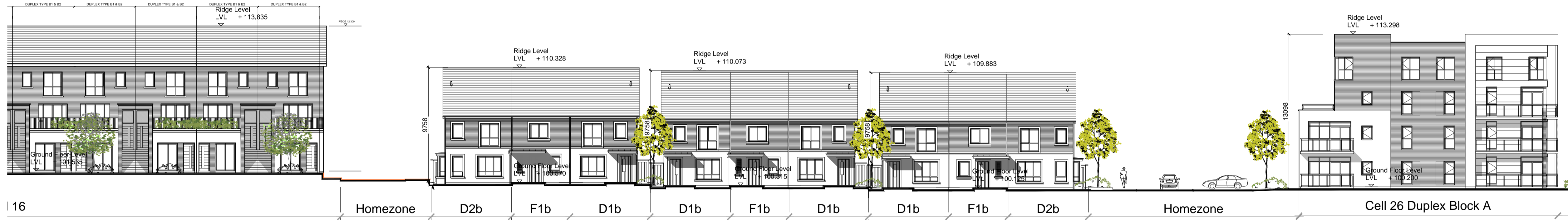
CONTEXT SECTION 3 - 3, PART 'B' Scale 1:200@A1