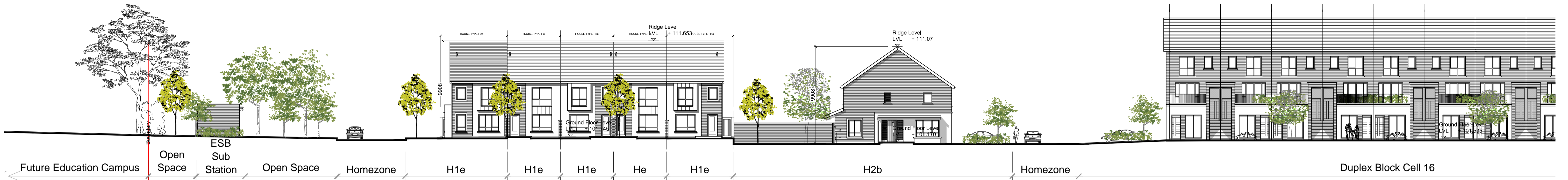
CONTEXT SECTION 3 - 3, PART 'A' Scale 1:200@A1