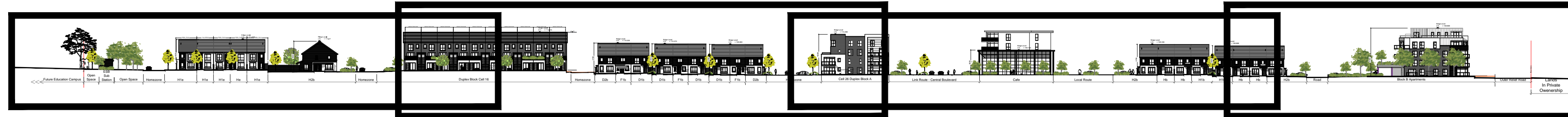
CONTEXT SECTION 3 - 3, Scale 1:1000@A1