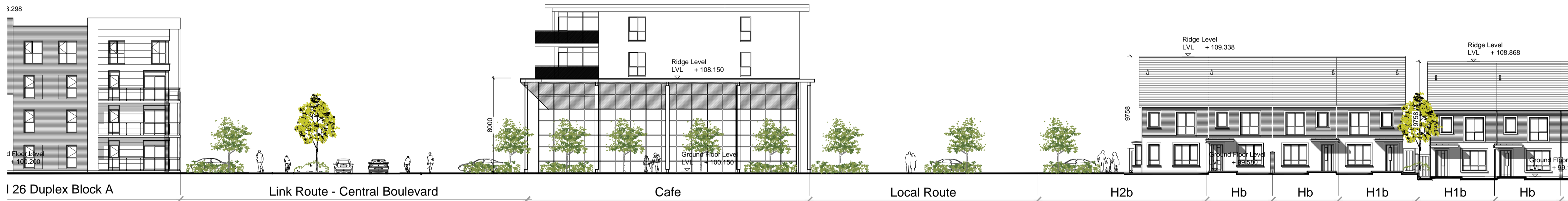
CONTEXT SECTION 3 - 3, PART 'C' Scale 1:200@A1